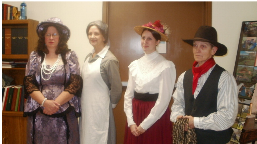
"She Did What She Had To Do" characters from the Ladies Tea. How ladies survived in the West.